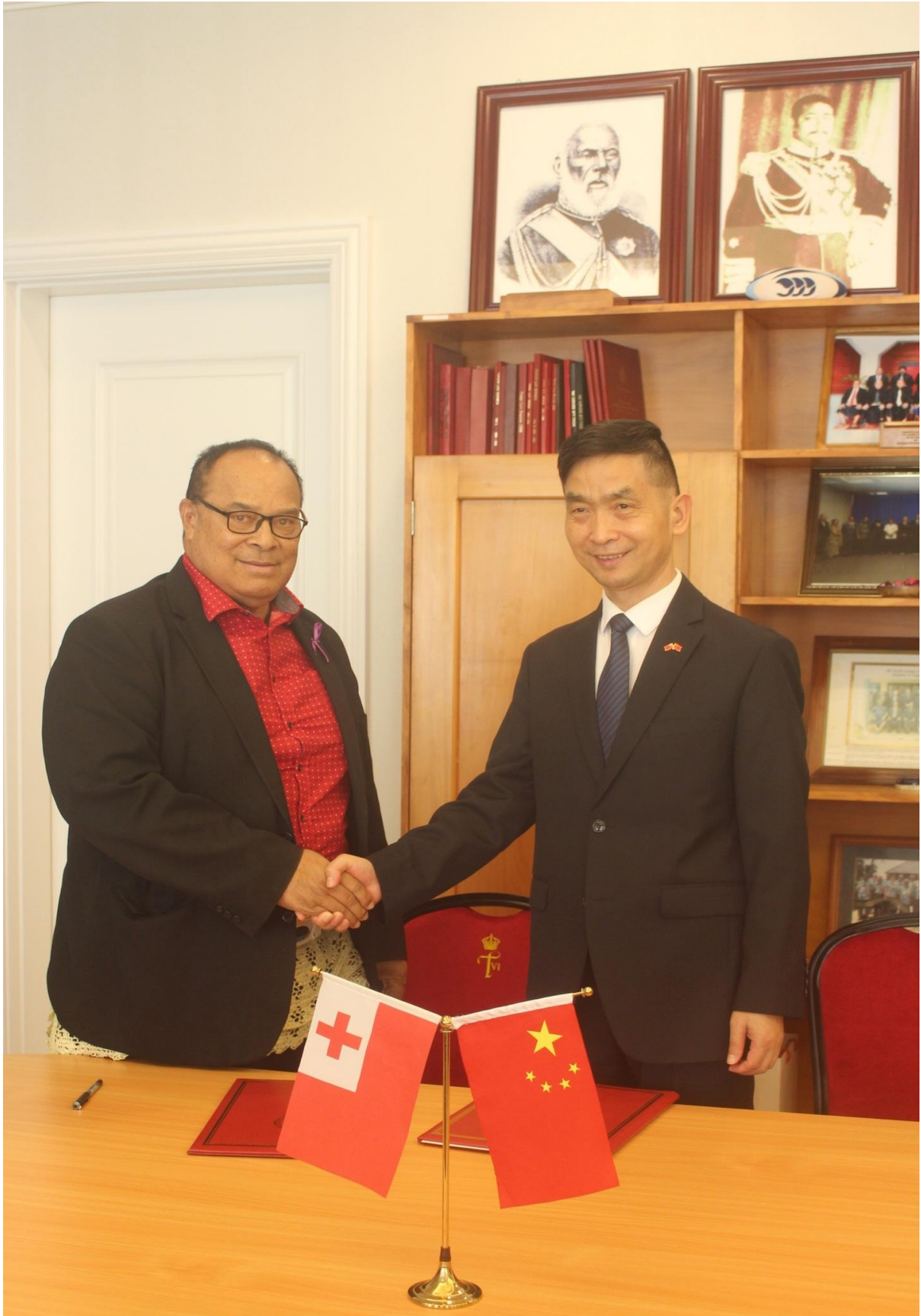
Hon Prime Minister Dr. Rev. Pohiva Tu'ionetoa & His Excellency Cao Xiaolin Chinese Ambassador to Tonga.